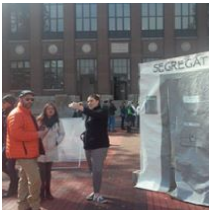
CPR CELL ON THE DIAG FOR THE UNIVERSITY OF MICHIGAN "HUMANIZE THE NUMBERS" EVENT