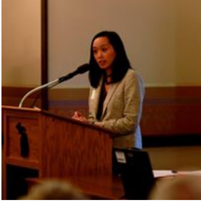
Rep. Stephanie Chang at CPR 2016 Legislative Day