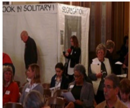
CPR 2016 LEGISLATIVE EDUCATION DAY MOCK SEGREGATION CELL IN SPEAKER'S LIBRARY, CAPITAL BUILDING, LANSING