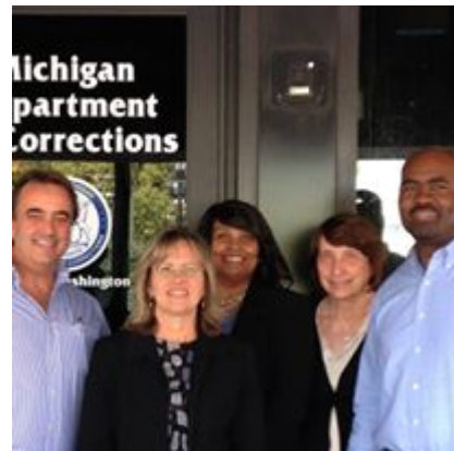
Family Advisory Board

HB 4565 which would require the MDOC to maintain a family advisory board passed the House of Representatives on April 28 and was assigned to the Senate Judiciary Committee on May 3, 2016.