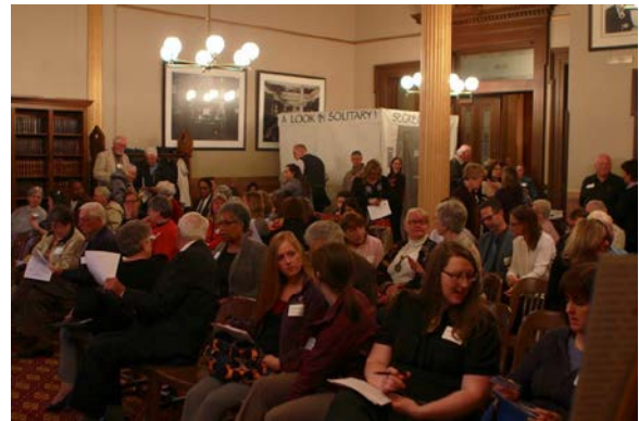
Fifth Annual CPR Legislative Education Day – 2016